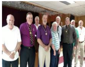
2017-2018 LOOM Officers